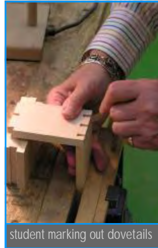
student marking out dovetails

Students may initially work on set projects in order to cover the essential elements of working with wood, with the opportunity of progressing through to making their own pieces of furniture.