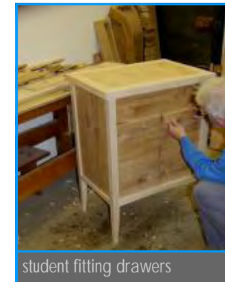
student fitting drawers

Certain topics, such as dovetailing or an introduction to laminating and veneering, can be covered as a set programme, where requested.